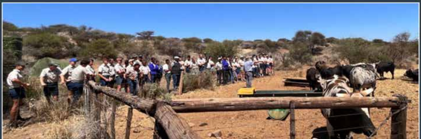
Talking about the Nguni bulls