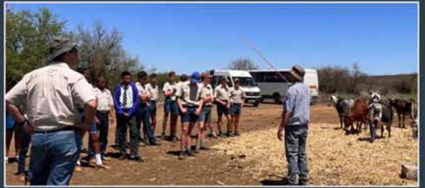
Even the teachers were intrigued