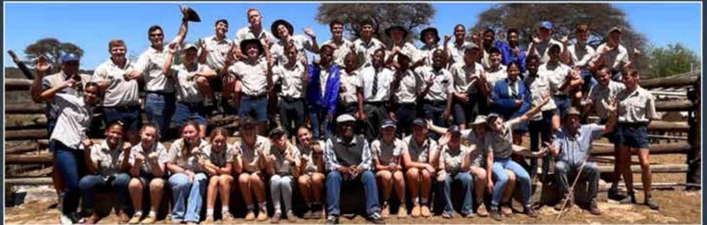
The group from Douglas High School