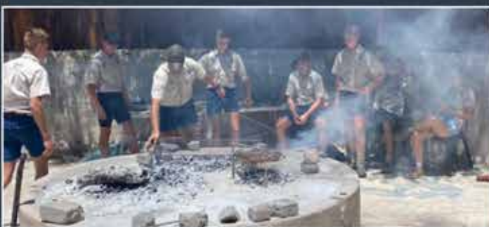
Then the "lekker braai"!