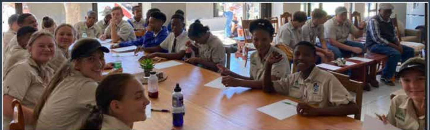
It is test time