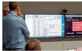
BKB het groot planne vir digitale veilings