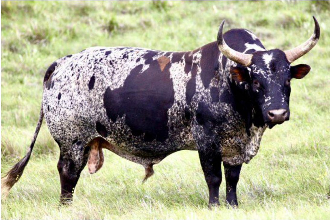
A bull from the famous Nandi Nguni stud was sold for a world record price of R310 000

A bull from the famous Nandi Nguni stud was sold for a world record price of R310 000 during the KZN Elite Nguni auction, which took place via WhatsApp on 9 May 2020. The proven bull, sold by the LBC Biggs Trust, boasts outstanding figures – he has a cow value of 108, a growth value of 110, and a production value of 109.