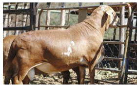
Aanlyn veiling oortref verwagtinge