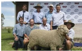
Rekords spat op Dohne-veiling